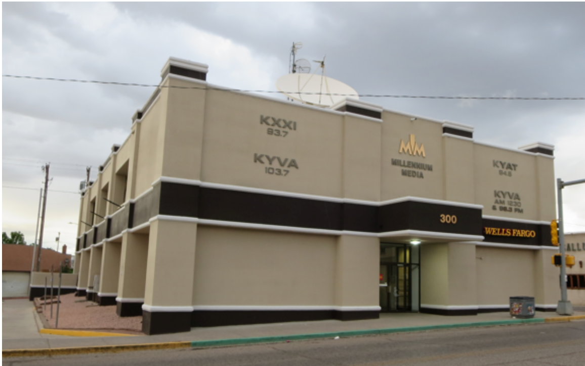
Millennium Media-Wells Fargo building repainted