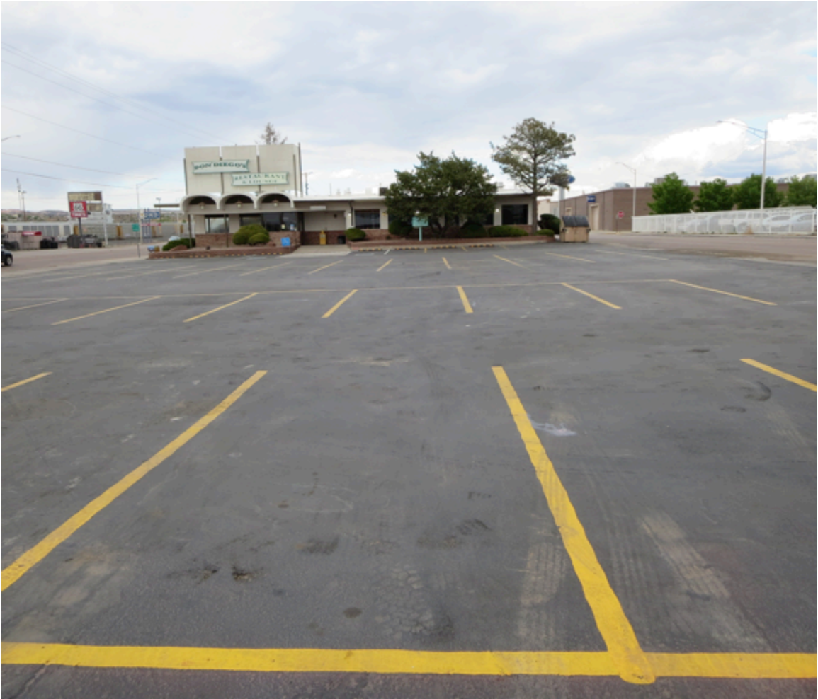
Don Diego Restaurant parking lot repaved